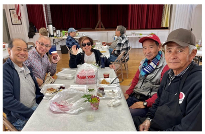
Otaka (karate) Sensei and karate members